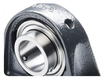
Fig. 2: All housing bearings are prepared for relubrication