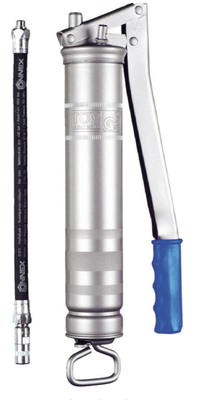
Fig. 3: Manual one-hand grease gun